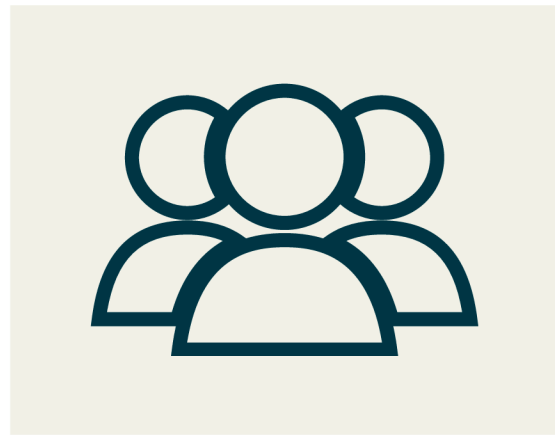
More volunteers & team members

Will you partner with us? Your support makes all the difference!